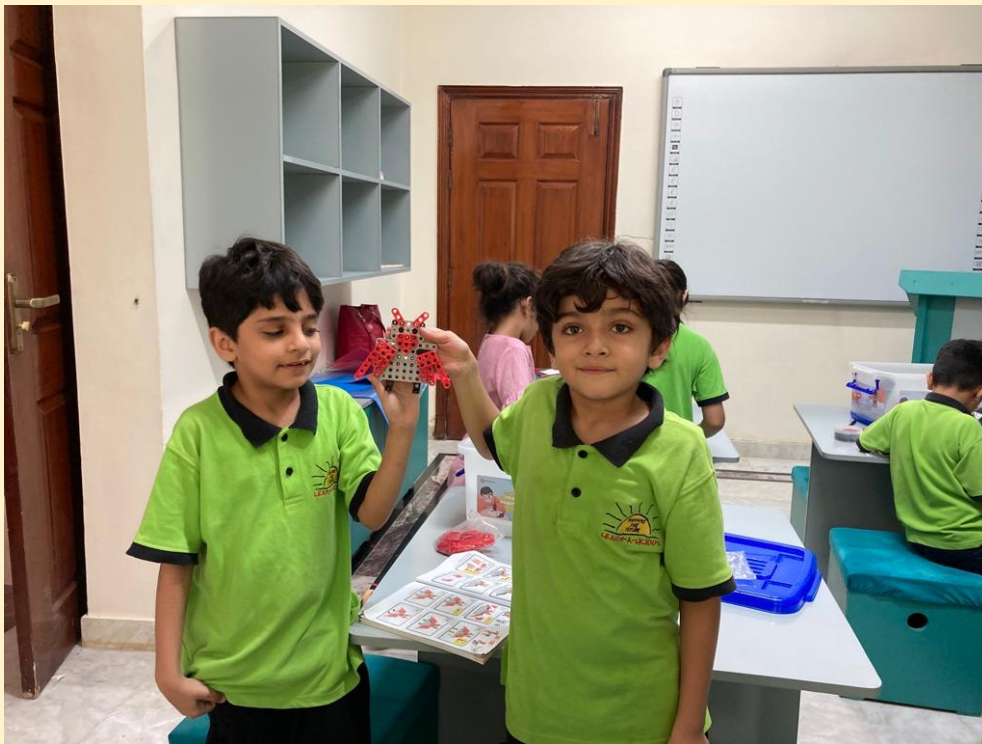
(Children of LAL STEAM School super proud and happy with their latest creation!)