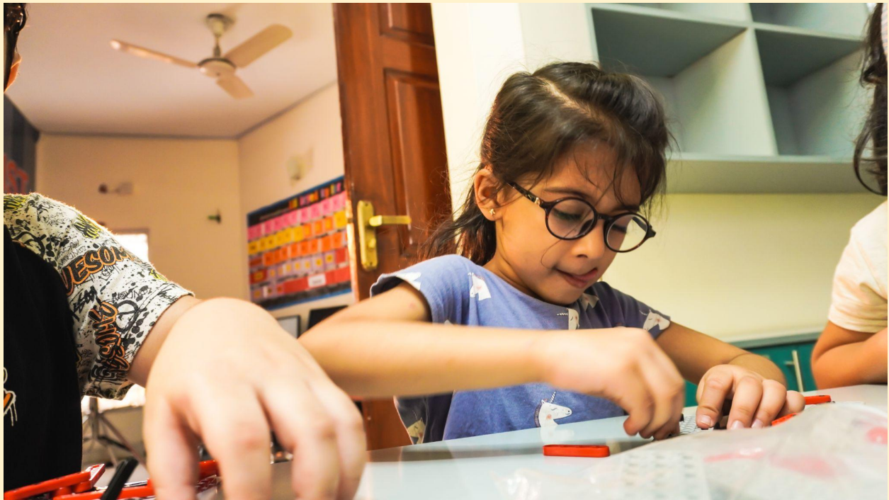
(Hard at work in LAL's STEAM LAB!)

STEAM is built and developed in a way that practically forces your child to learn these skills. This . . . is the foundation of STEAM. This is what STEAM can do for your child.