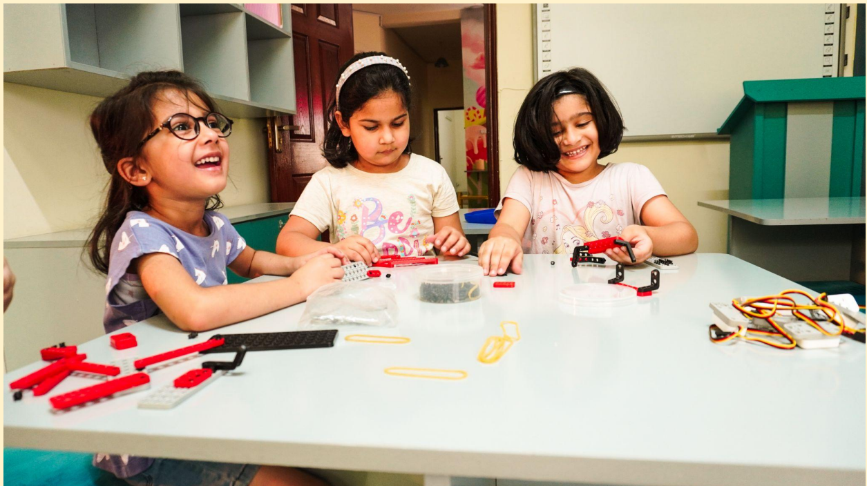
(All smiles during the Robotics class at LAL STEAM School!)

And the best part? They will never be under the fear that they're being assessed for what they're doing.